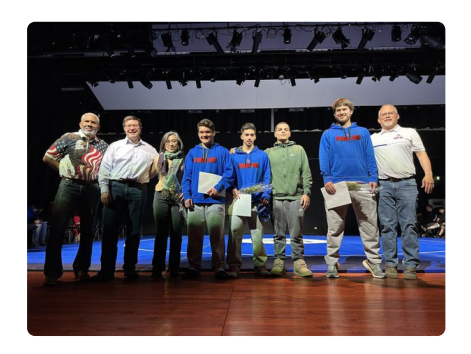
Boys Wrestling Senior Night