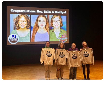
IHSA All-State Theatre Fest