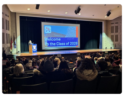
Welcome to the Class of 2028