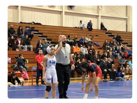
Upstate Eight Girls Wrestling Conference Meet